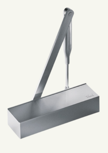
Also available in Gold

The Value Doors & Windows fire door set is available with two options of surface-mounted door closers. The TS72 closer can be fitted on the internal face of the door only, and the TS92 slide arm closer is suitable to be fitted to the internal or external face of the doorset. Both closers are available in gold and chrome finish and the fixing positions are pilot drilled for installation on site.